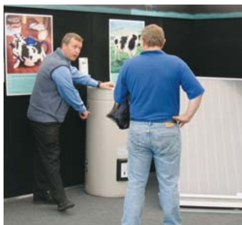
Demonstrating solar hot water heating at our Central District's Field Days stand.

Meridian Energy will be at National Fielddays, to be held at Mystery Creek from 13-16 June, and the South Island Dairy Event on 18-20 June at Lincoln University. We look forward to welcoming you to our stand.