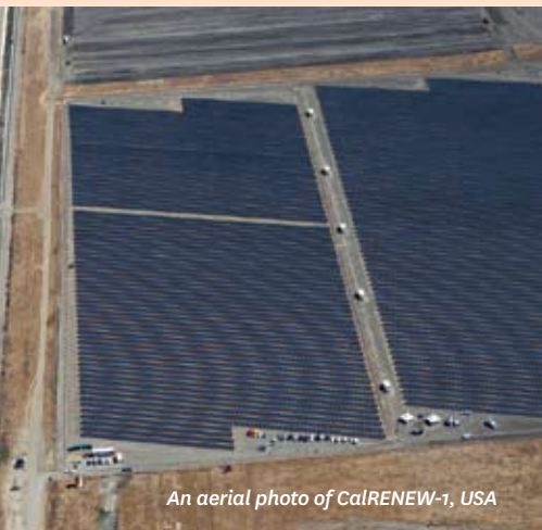
An aerial photo of CalRENEW-1, USA

Always looking to be at the cutting edge of clean technology innovation, the Meridian team has identified that electricity generated from the sun is almost at the stage where it will be competitive with other forms of electricity generation.