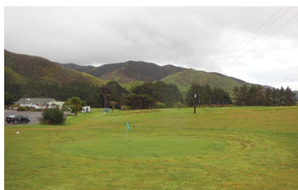
Before and after shots of Karori Pitch and Putt's 9th hole which is now all ready for the summer season.