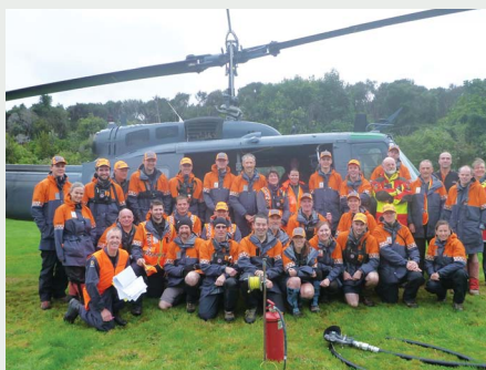
LandSAR Wellington members in uniforms similar to that purchased with support from the West Wind Community Fund