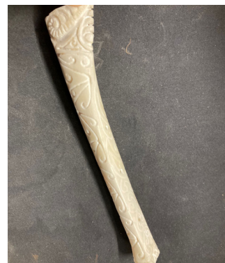
Kōauau - bone carved flute.