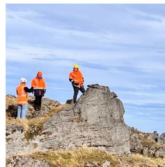
The Specialist Avifauna Monitoring Team in Action.