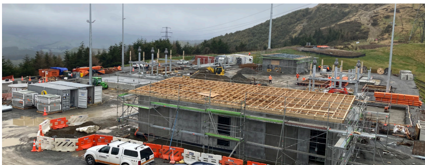
Construction of the substation.

Work has been steady on the substation build. The control room foundations have been completed and concrete wall panels lifted into place. Soon the two transformers required for the wind farm will be arriving in New Zealand. The transformers take close to a year to be built, then require rigorous testing before they are transported by ship from South Korea.