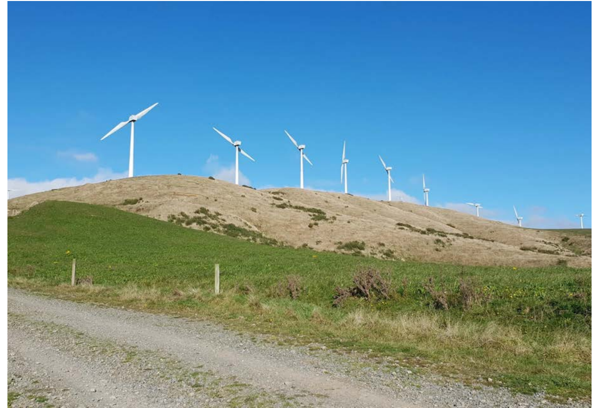
Existing turbines at the Te Rere Hau wind farm