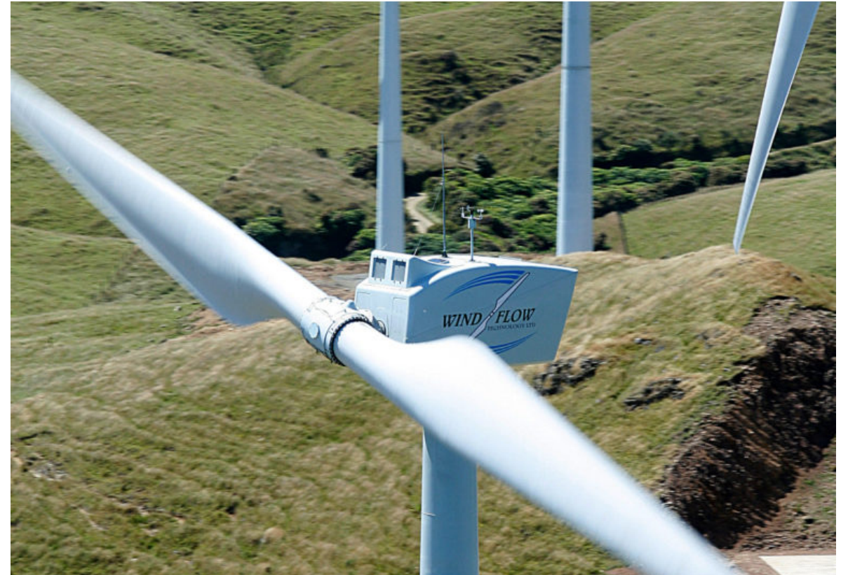
Existing turbines at the Te Rere Hau wind farm