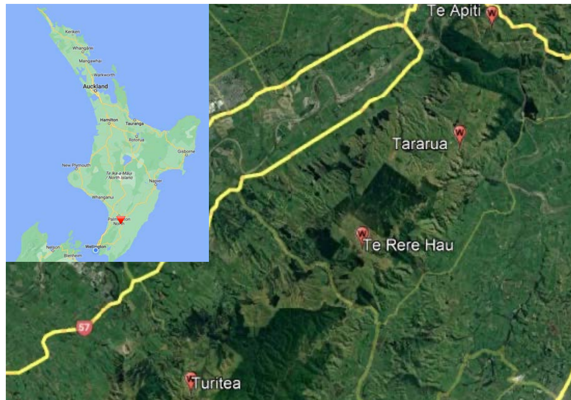
Te Rere Hau wind farm is located in the Tararua Ranges outside of Palmerston North