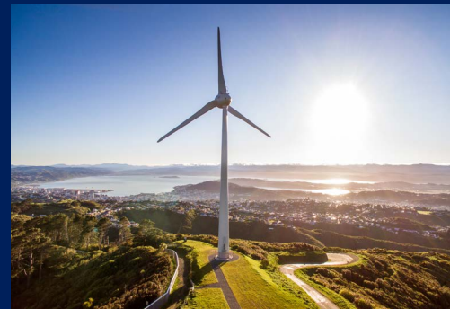
Brooklyn Wind Turbine (2016)