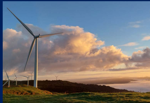
Te Uku Wind Farm (2010)