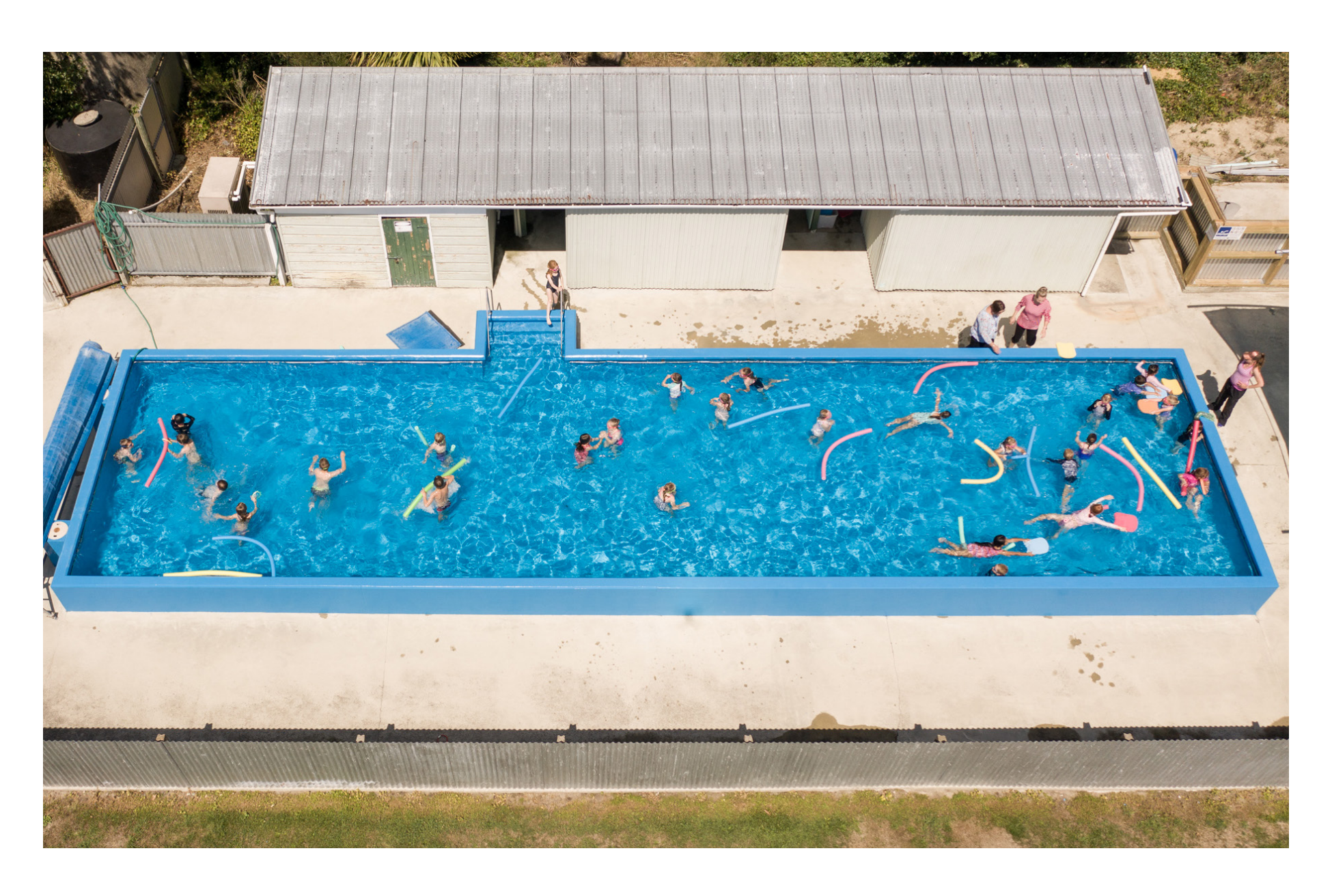
Duntroon Primary School swimming pool